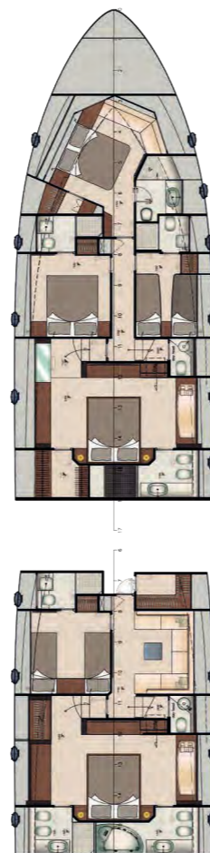
Sub Lower Deck