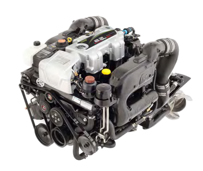
MERCURY 8.2L V8 380ЛС / 430 ЛС B3 FWC DTS