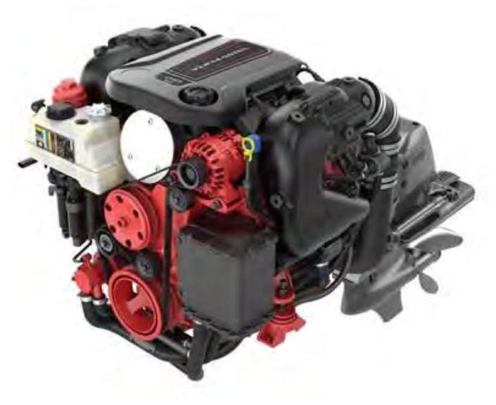
VOLVO 5.3L V8 350ЛС DP FWC EVC