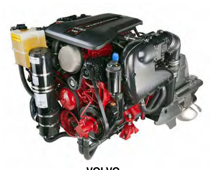
VOLVO 6.2L V8 380ЛС / 430ЛС DP FWC EVC