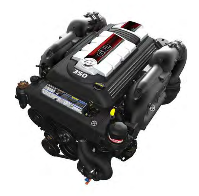
MERCURY 6.2L V8 350ЛС B3 DTS(стд)