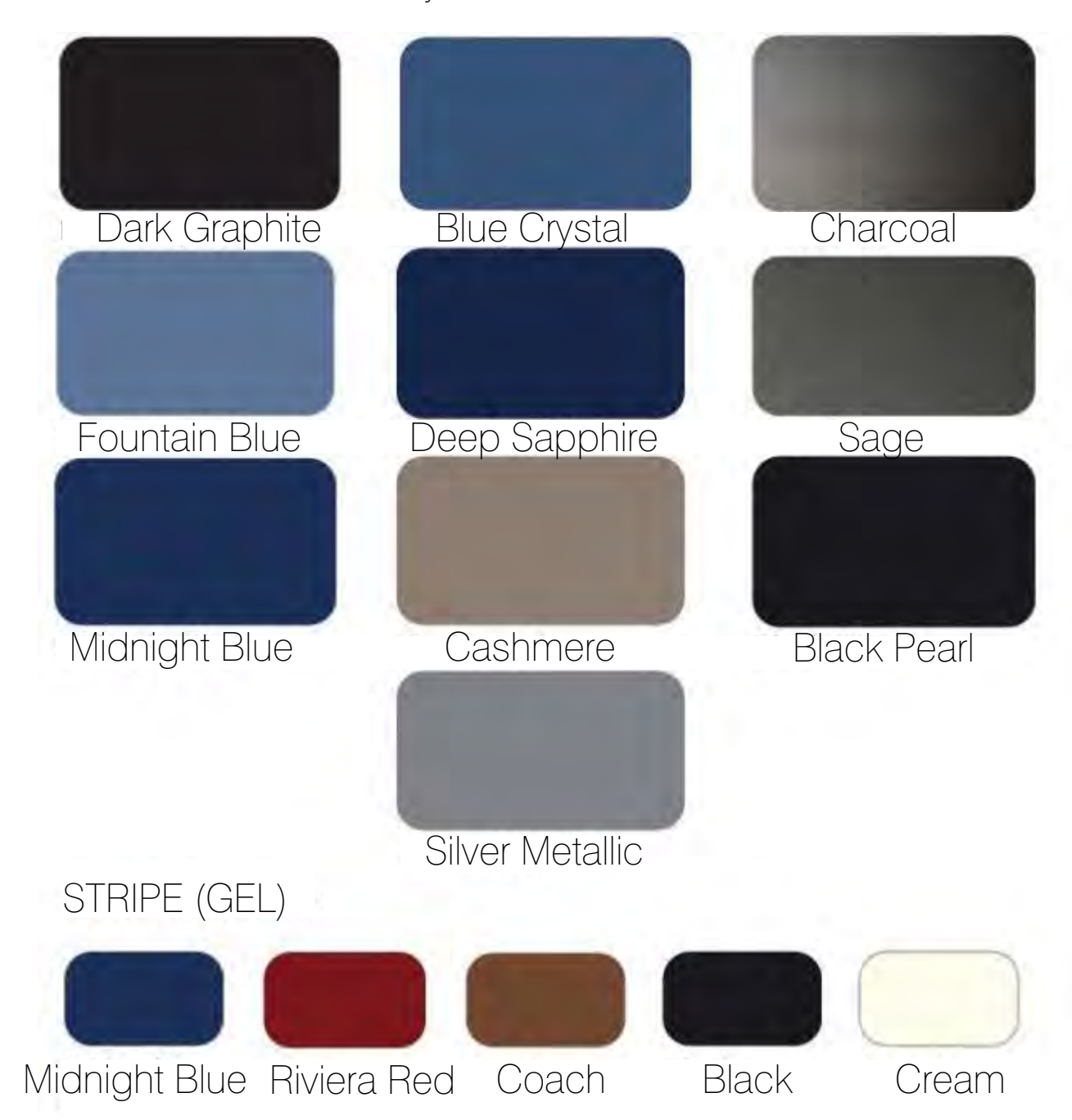
Primary colors of the boat hull