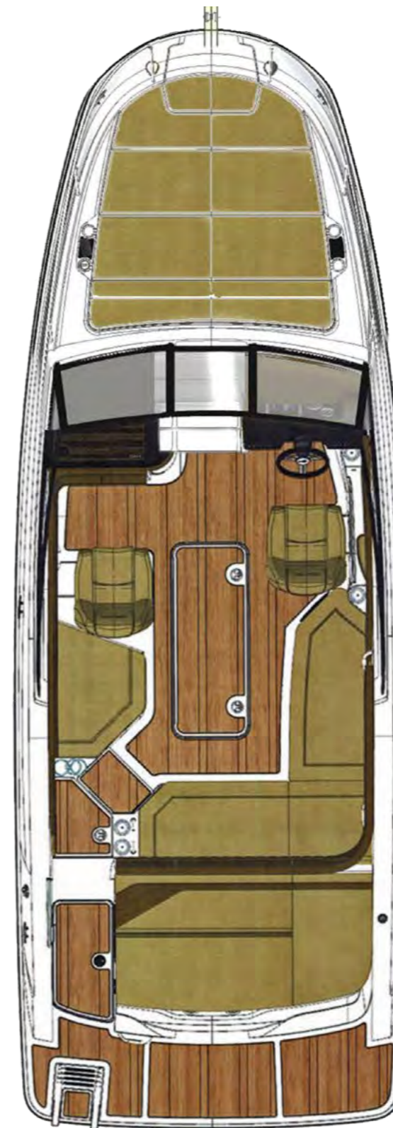
BOW & COCKPIT