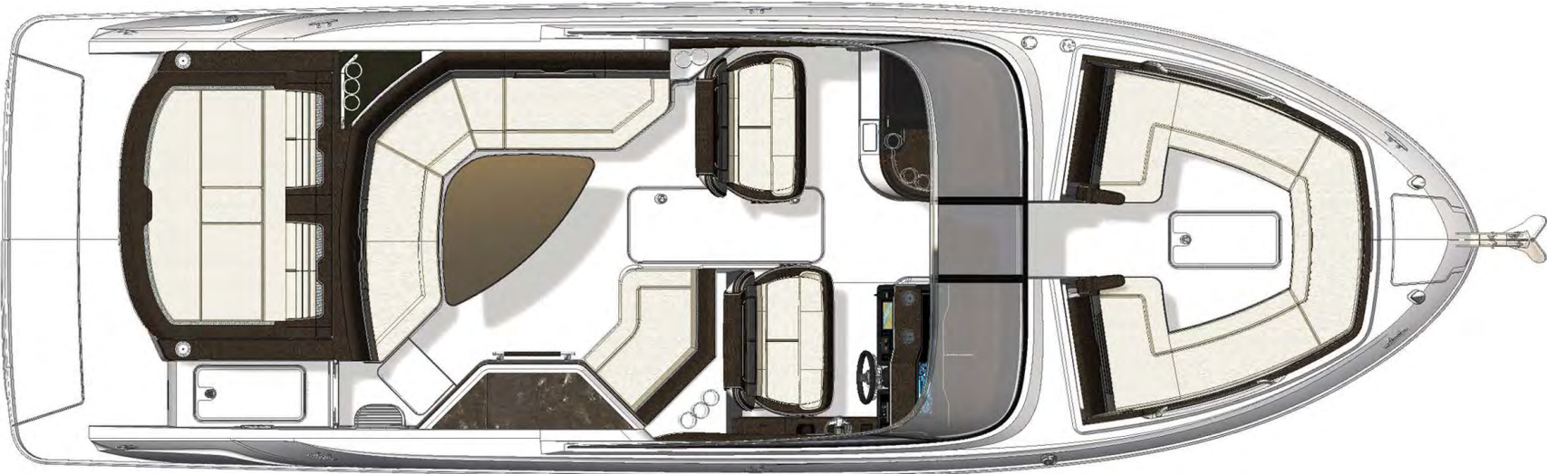
DECK / COCKPIT