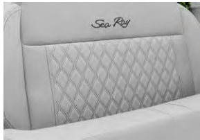
Stone Gray base with dark gray accents