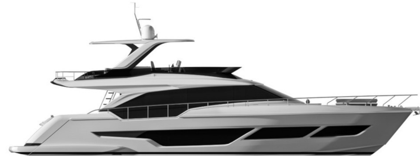
HARD TOP VERSION