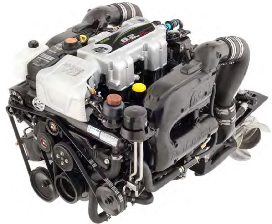
TWIN MERCURY 8.2L V8 - 430 ЛС X 2 B3 FWC DTS w/joystick