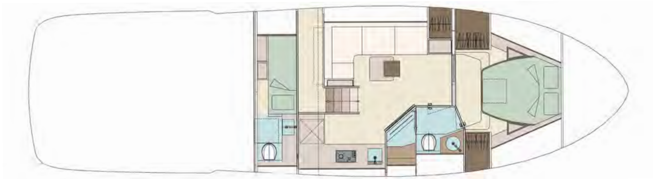
Lower deck crew