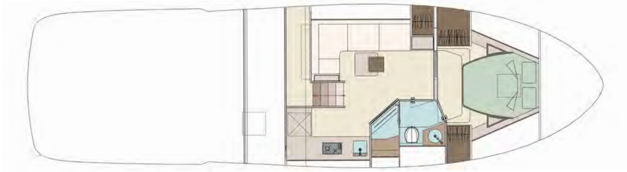
Lower deck STD