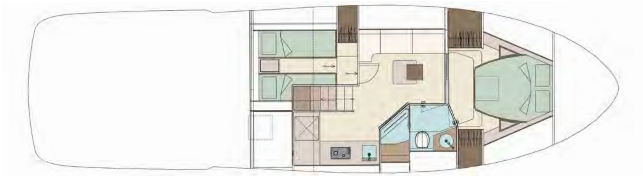
Lower deck two cab