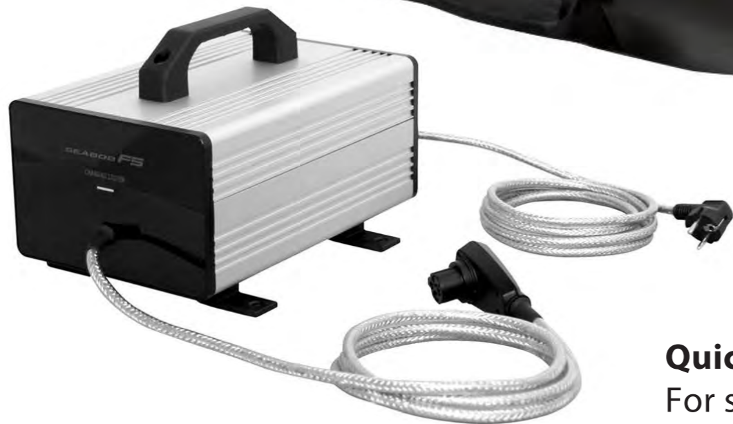
Quick Charger For short charging times