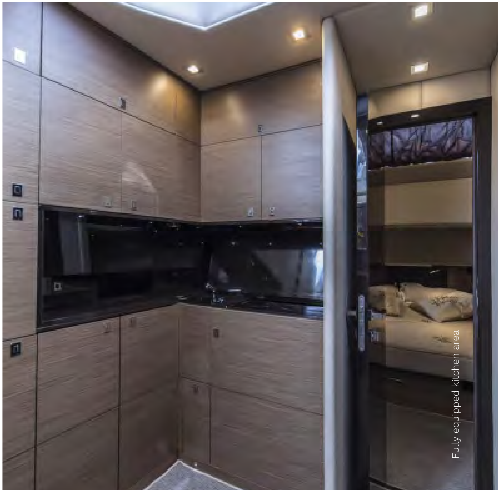
Fully equipped kitchen area