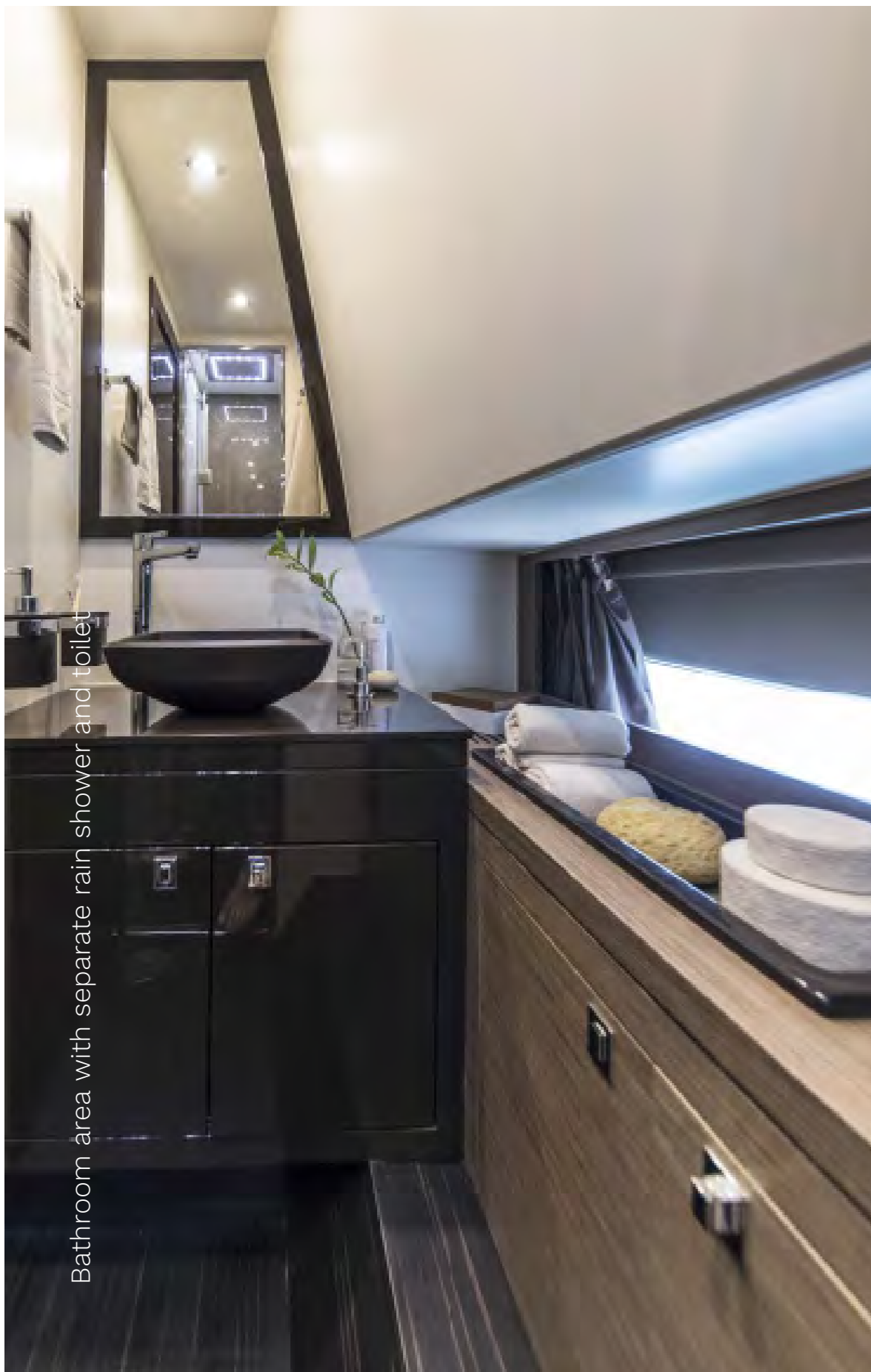
Bathroom area with separate rain shower and toilet