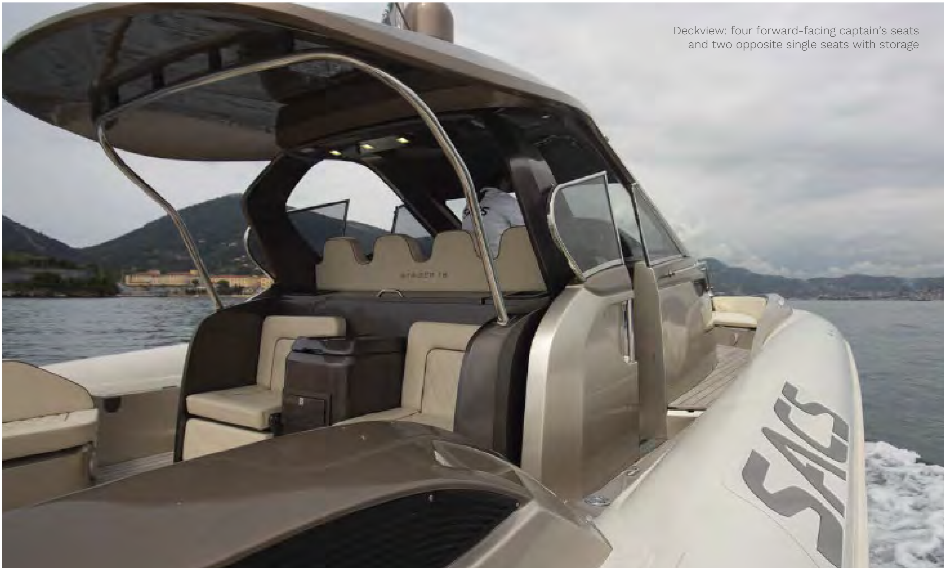
Deckview: four forward-facing captain's seats and two opposite single seats with storage