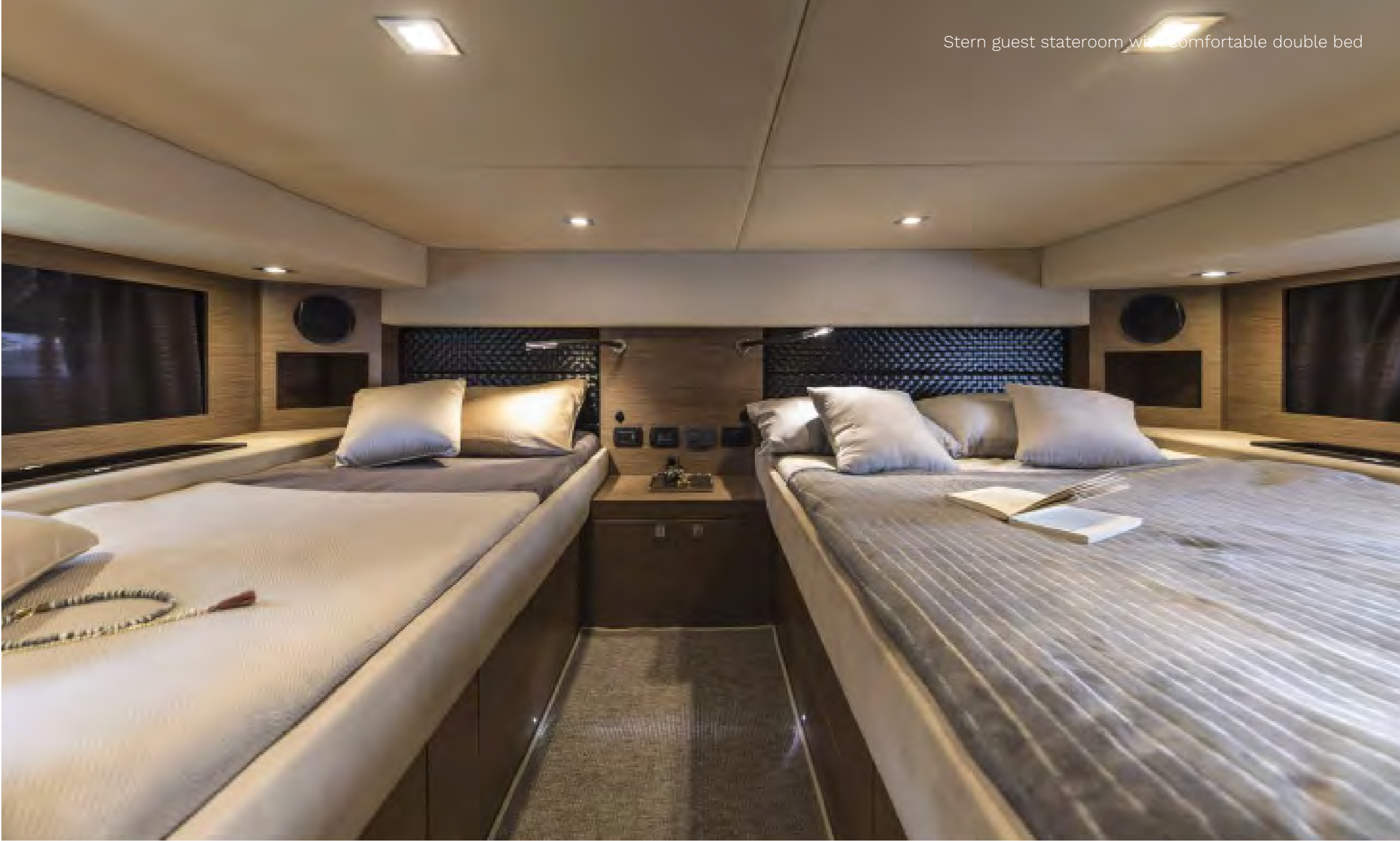
Stern guest stateroom with comfortable double bed