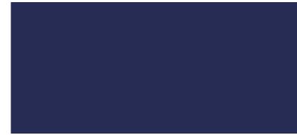
SEA RAY BLUE