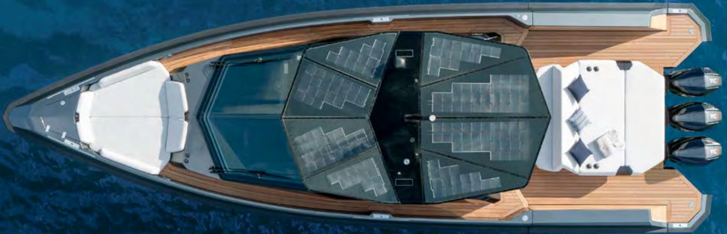
Solar energy Solar panels mounted on the T-top to power battery pack running the gyro stabiliser for silent mode at anchor