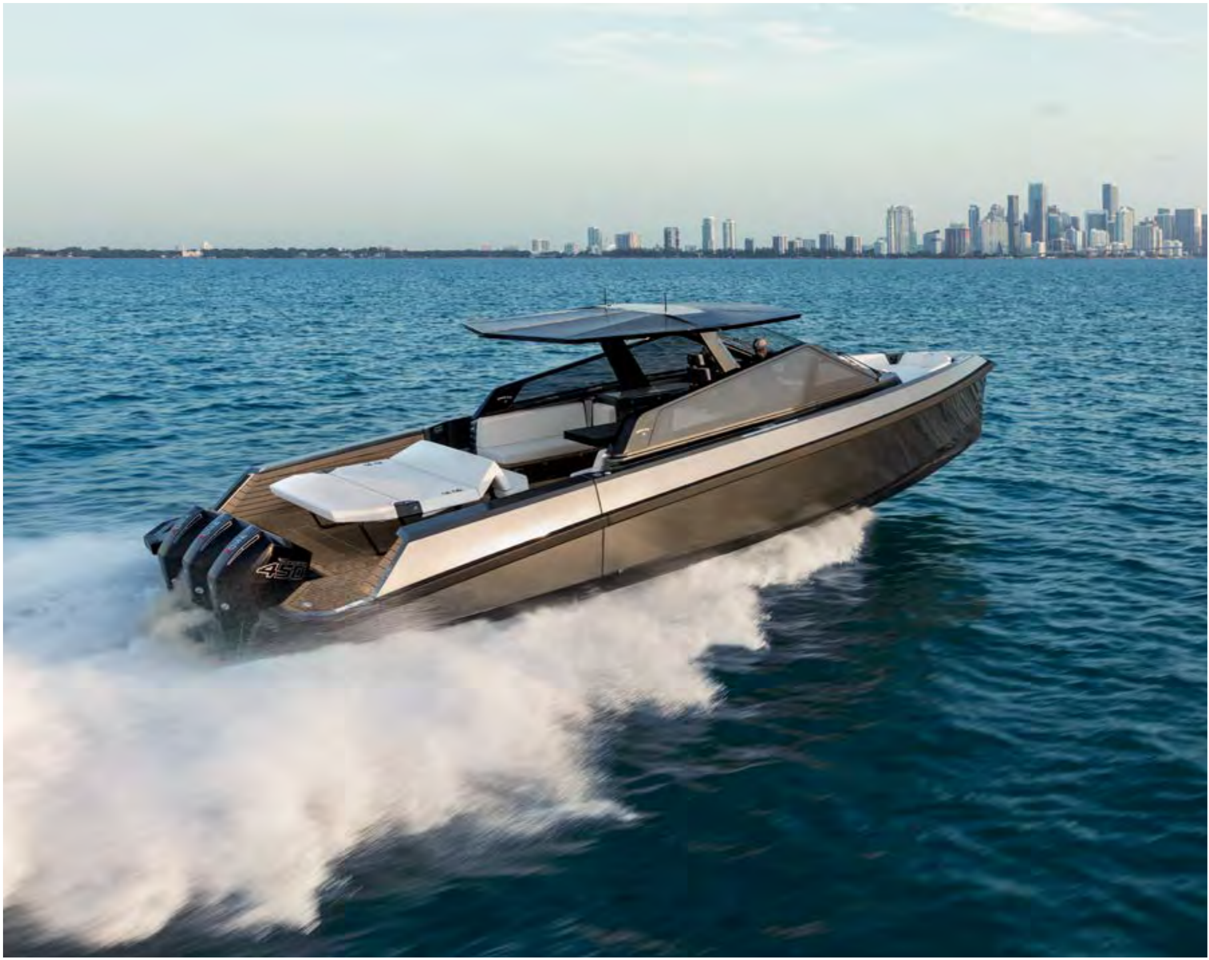
Wally shows its sportive side with wallytender43X