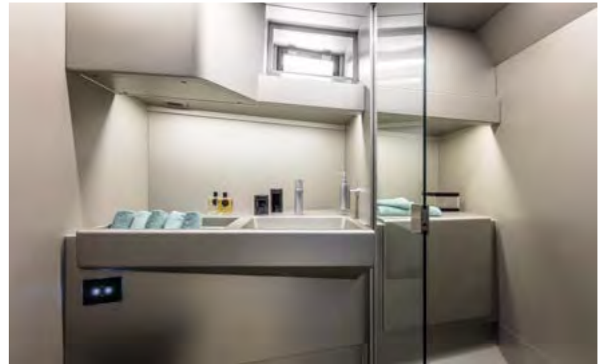
Air-conditioned cabin Generous bathroom with separate shower